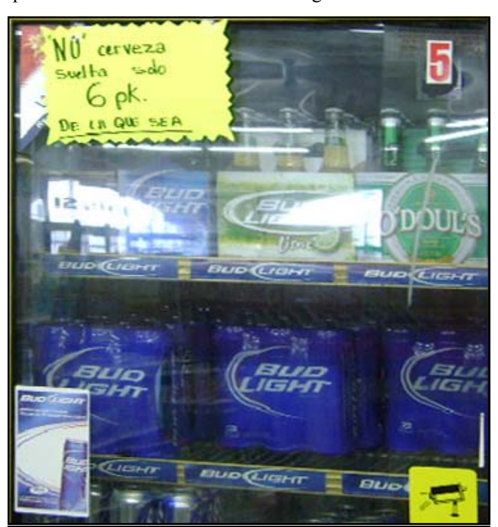
After being cited for violating the restriction against selling single serve alcoholic beverages, a local convenience store removed the items from their shelves and posted a sign indicating they were no longer allowed to sell such items.

In response to this problem, the Office of the City Attorney launched an enforcement campaign in May, 2009 to bring local alcohol retailers into compliance with all regulations. This campaign has been successful with cited businesses removing the banned products from their shelves. However, enforcement alone can not solve the problem, as many retailers are exempt from the ban, having been in business before it went into effect. Therefore, public officials feel that additional regulations are needed