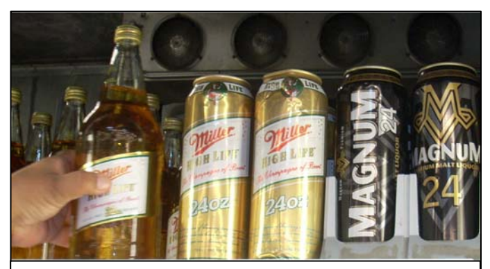
24 ounce cans of beer are the most common type of singleserve alcoholic beverages being sold in San Bernardino, but 32 and 40 ounce bottles are also found in many supermarkets and convenience stores.

leads to public intoxication and a wide range of associated problems including driving under the influence, public urination, litter, and other disruptive behavior. According to research, such problems are reported on a regular basis by residents living in the proximity of retailers that sell single-serves. In addition, there are also