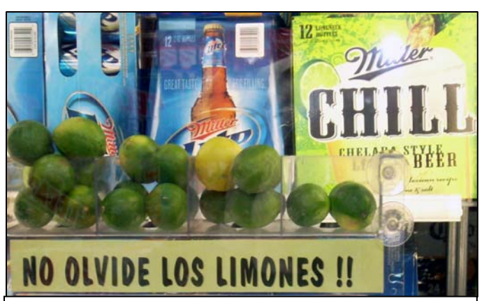
Since Hispanic customers prefer lemon with some types of beer, one San Bernardino store offers fresh lemons so that the product can be consumed immediately after purchase. (Sign reads: don't forget the lemons)

Secondly, single-serve products are routinely offered for sale cold and ready to be consumed. This frequently